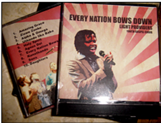
Back and front of "Every Nation Bows Down"; Light Provider Choir's first CD

What a year 2011 has been for Light Providers Choir! It's a joy to see it grow to become a world-class performer. The LP Choir's new CD — "Every Nation Bows Down" (see photo below) — was recorded live. Internationally, people love the music and CDs are selling well. LP is quick to thank Pinetown's Highway Community Church's youth