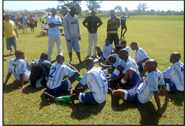
The coach’s half-time chat to his boys

“Is the History Makers soccer team ‘kicking butt’ or what?” The answer is yes. History Makers has become a most-respected soccer team in and around KwaNyuswa. In the last couple of months, History Makers participated in and won a few tournaments in Kwa- Nyuswa, more outside the city. Light Providers is very proud of its team’s achievements. Comprised of four teams — U13/, U/15/, U/17, and Open (the senior team) — History Makers symbolizes the incredible development of kids, especially those under the age of 15, who are at a vulnerable age due to the lack of activities available for early high school students to do after school days end in South African. Thankfully, kids’ confidence arose in 2011 based on how their skills, abilities, and gifts had been harnessed and made to flourish.