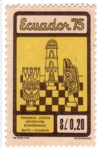
Chess Pieces on an Ecuadorean Stamp