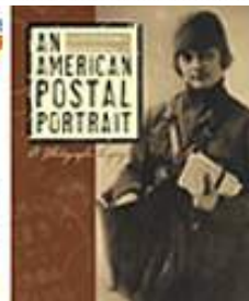
Two Special Books for Sale on Amazon.com