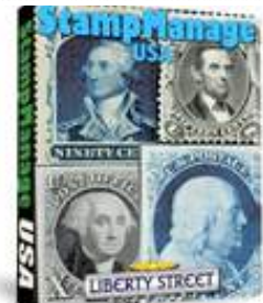
"Stamp Manage USA 2011"

Four to six auctions to be held by us in 2013!