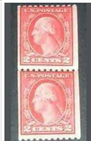
Scott #488: unused, NH coil pair