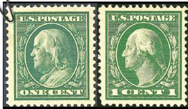
Franklin, Washington, 1908 and 1910

The Christian Collector newsletter represents a group of devoted stamp collectors. You are warmly invited to join our club.