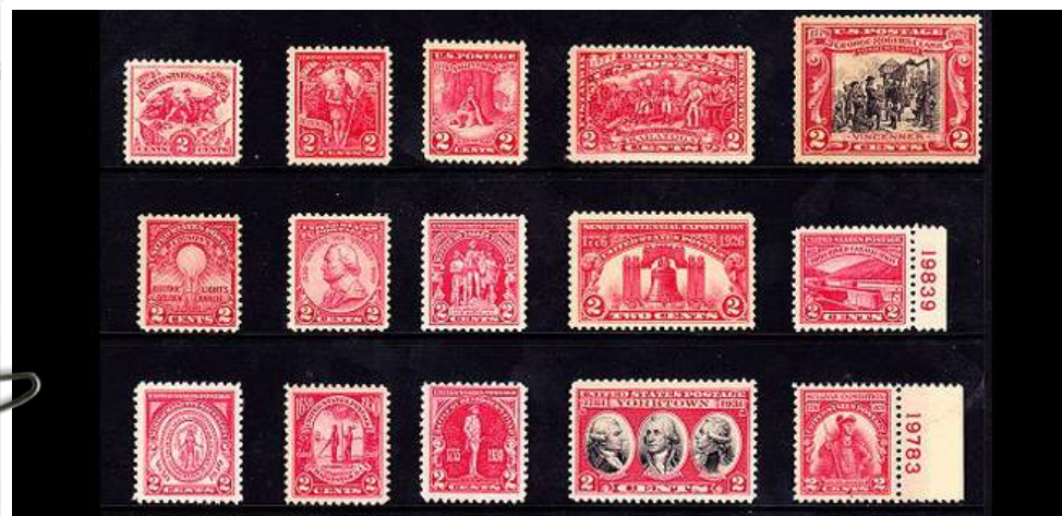
1926-1932 — Two-Cent Red Sesquicentennial Issues